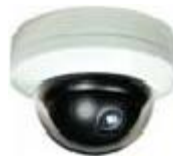
Mintron™ 83SR10HN •Indoor Mini-Dome •3.6mm lens

For more information on any of our products or services please