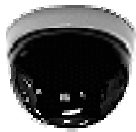
Mintron™ 83SR10HN-VF •Indoor Mini-Dome •3-9mm VF AI Lens