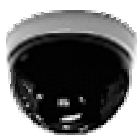
Mintron™ 83SR10HN-VF •Indoor Mini-Dome •3-9mm VF AI Lens