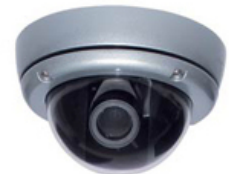
Mintron™ 83SR10HN-VP-VF •Indoor/Outdoor Mini-Dome •Vandal/Weather Resistant •3-9mm VF AI Lens